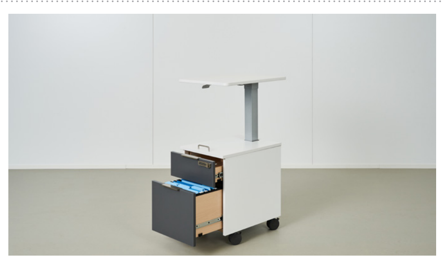
For the Type B version, the cabinet is replaced with box file drawer units.