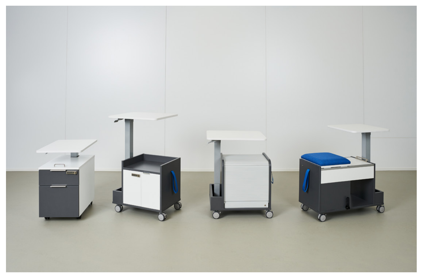
Scale 1:1 presents Sidekick, a collection of mobile work pedestals.

Available in four variations, Sidekick allows for the personalization necessary in the workplace. For Type B, the cabinet is replaced with box file drawer units. Type C is a combination of traditional cabinet and mobile work cart. Type T