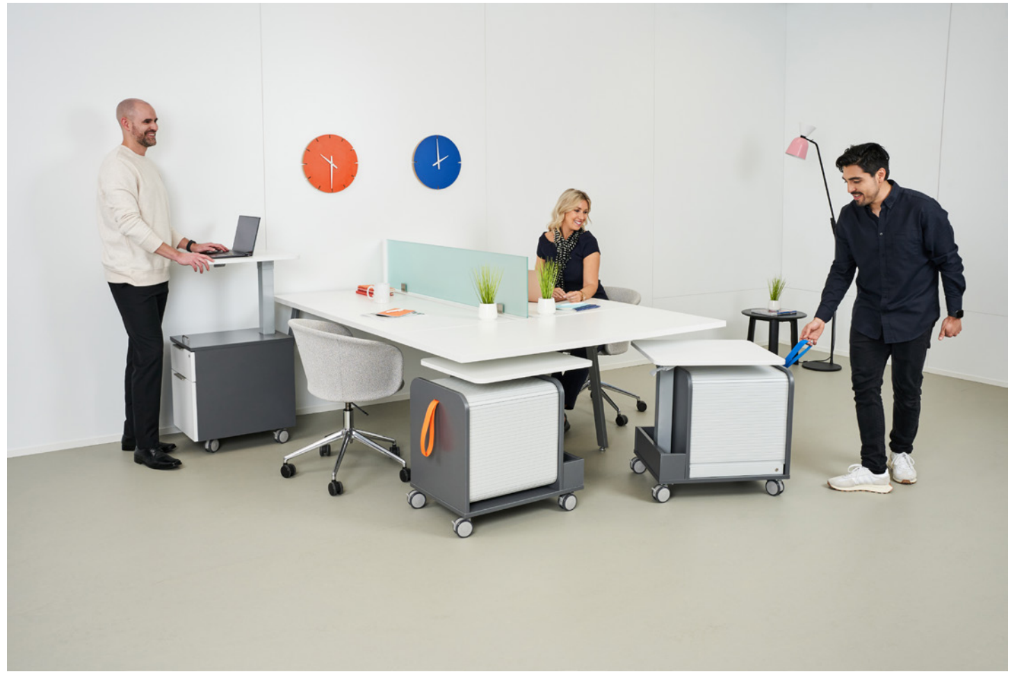
Sidekick units are not only mobile, they are also multifunctional.