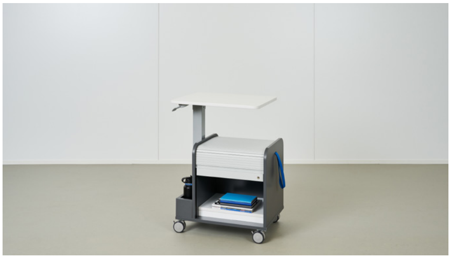
Type T features a unique locking tambour door for securing personal items.

features a unique locking tambour door for securing personal items. And Type W, also known as the workhorse, includes a sliding padded seat and foot stirrups for added comfort.