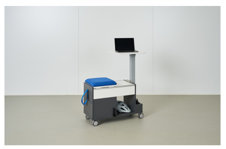
Type W, also known as the workhorse, includes a sliding padded seat and foot stirrups for added comfort.

Winston noted that no matter how or where people use the product, it gives them more autonomy, which is essential in a hybrid world. "It's about this idea of freedom, the same independence that our laptops and cell phones give us. We can take a Zoom call anywhere today. Sidekick is the companion furniture, the missing piece that complements all of the tools that we use for remote work," he added.