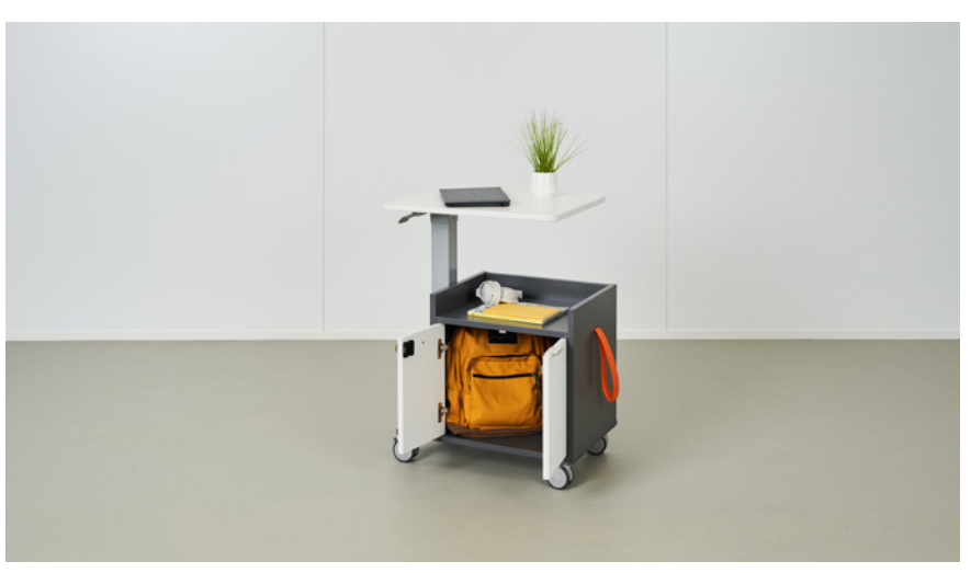
Type C is a combination of traditional cabinet and mobile work cart.