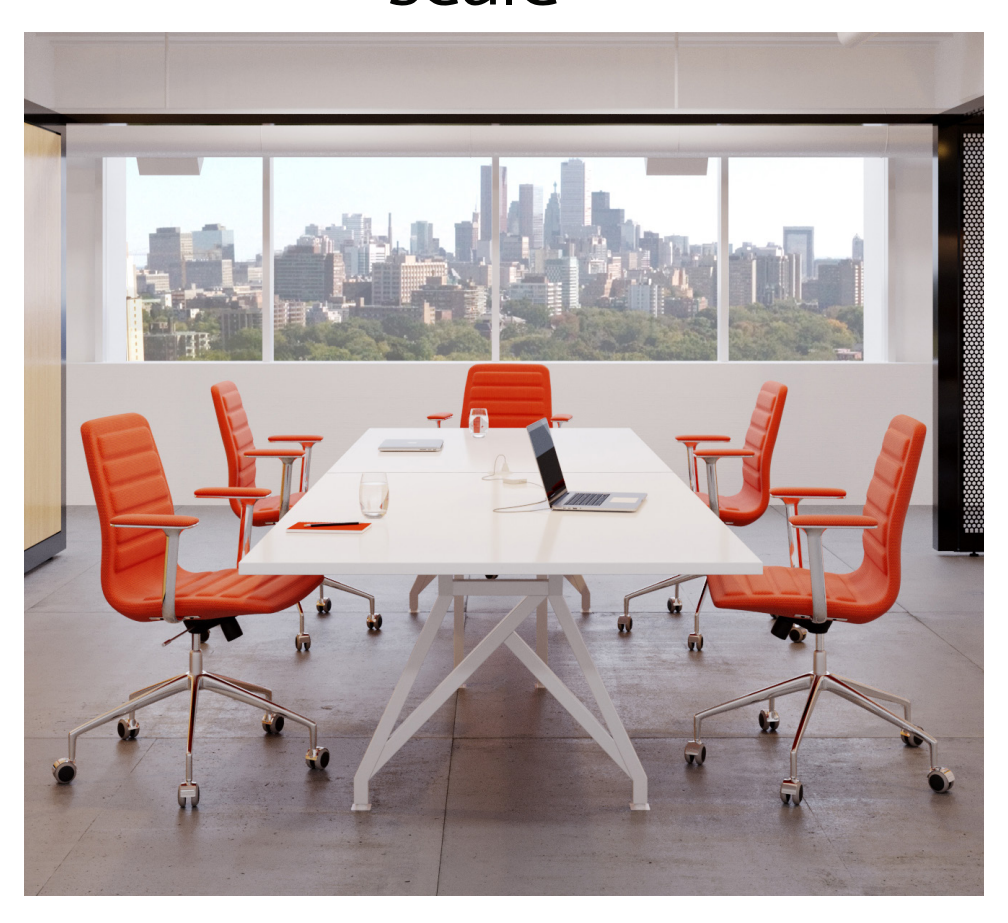
work together. play together.